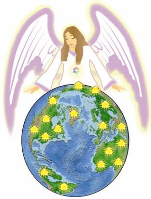
Promoting HOPE (Healing Our Planet Earth) one person at a time through turning on the Lights.